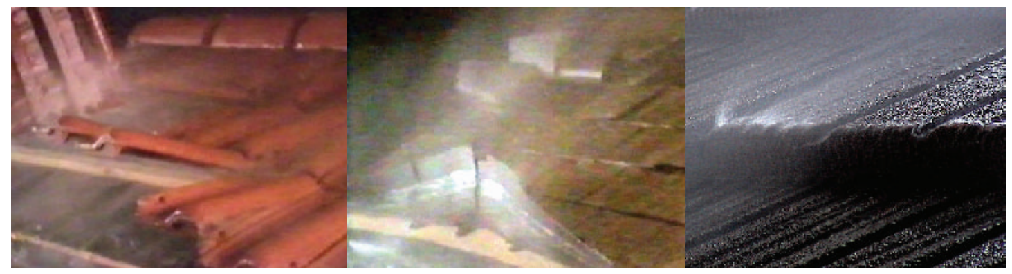
Concrete/Clay Tile Asphalt Shingle AHI Roof