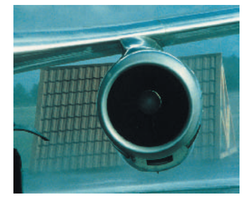
AHI roofs withstand the toughest wind testing.

is introduced into the windstream and can be directed horizontally, vertically or any direction in between. Under all angles, and with a water application of 50 millimetres per second per square metre of roof area (equivalent to 180 mm of rain per hour), no leakage was observed.